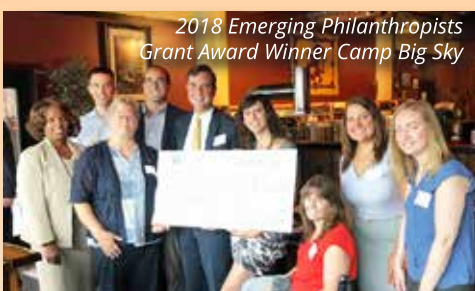
2018 Emerging Philanthropists Grant Award Winner Camp Big Sky

The Emerging Philanthropists Fund is an initiative designed by CFCI to invigorate emerging community leaders to join together as philanthropists. The group is comprised of a cross section of professionals in the community who like to have fun, but who also want to positively impact the quality of life in central Illinois. Members pool together their annual contributions to grow the fund. Each year, a portion of the fund is granted to a local nonprofit. Emerging Philanthropists Fund members ultimately vote on the recipient of the grant.