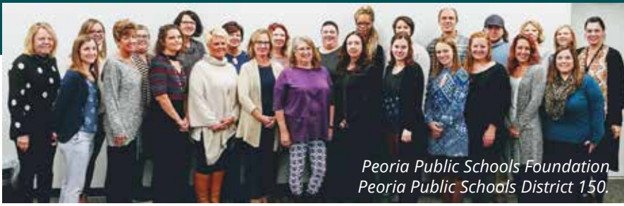
Peoria Public Schools Foundation Peoria Public Schools District 150.

The Yeomans Fund grants many scholarships. They granted money to the Peoria Public Schools District 150 for their Classroom Grants. This grant is available to teachers interested in additional projects to enrich the classroom experience for the students.