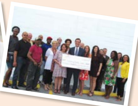
RIGHT PHOTO: 2017 Emerging Philanthropists Grant Award Winners Friends of Proctor Center